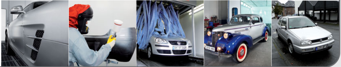
2 Added Elastic Additive 9050